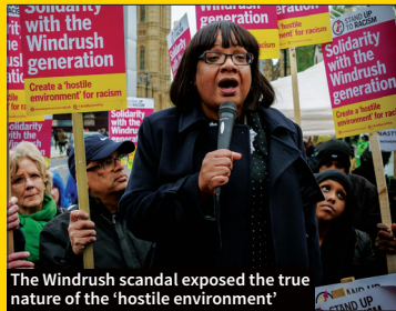
The Windrush scandal exposed the true nature of the 'hostile environment'