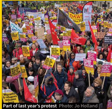
Part of last year's protest

Check out the facebook event page for updates: bit.ly/SUTR20y